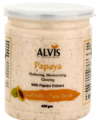
Exfoliating Face Scrub 400 gm