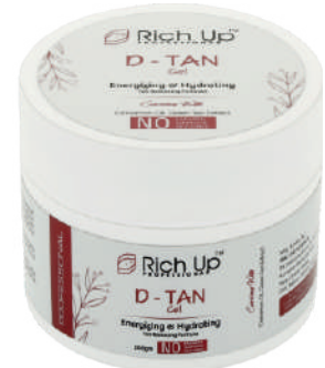
D-tan Gel 200 gm