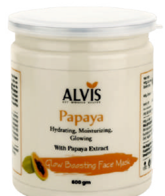
Glow Boosting Face Mask 600 gm