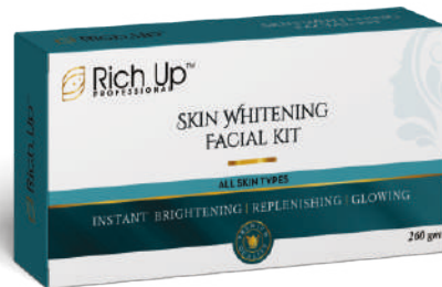
Skin Whitening Facial Kit - 260gm

Instant Brightening Replenishing Glowing