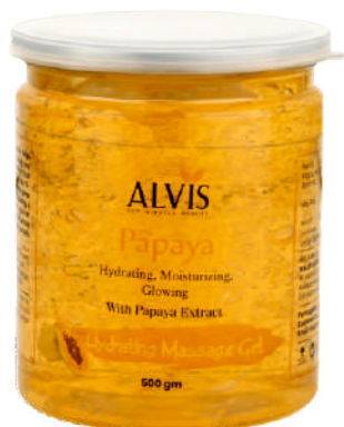
Hydrating Massage Gel 500 gm