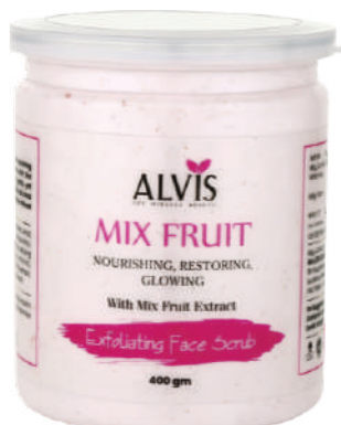
Exfoliating Face Scrub 400 gm