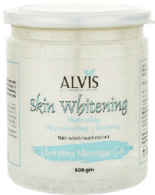
Hydrating Message Gel 500 gm