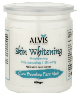
Glow Boosting Face Mask 600 gm