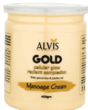
Massage Cream 400 gm