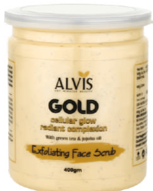
Exfoliating Face Scrub 400 gm