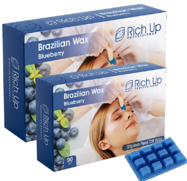
Blueberry - 90 gm / 400 gm Stripless peel off wax