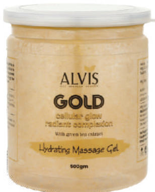
Hydrating Message Gel 500 gm