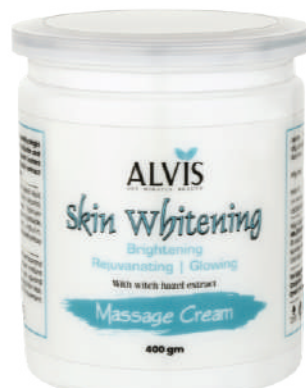
Massage Cream 400 gm