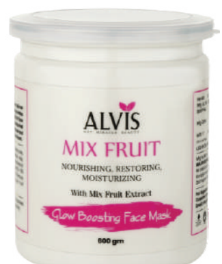
Glow Boosting Face Mask 600 gm