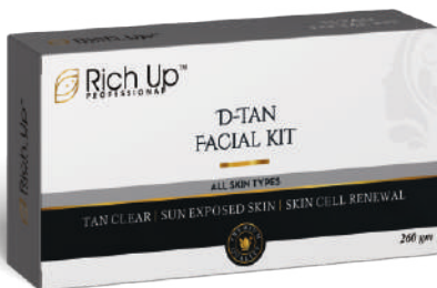
D-Tan Facial Kit - 260gm