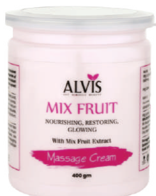
Massage Cream 400 gm