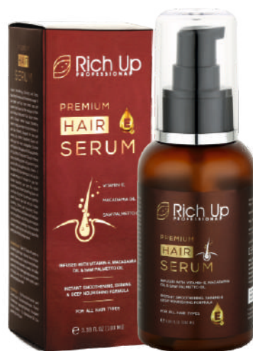
Premium Hair Serum 100 ml

Richup Professional Hair Serum comes with a Smooth Intense Instant Smoothing Serum to help you regain the lost moisture of your hair. Perfectly designed for men and women, this Instant Smoothing Serum will make your hair more manageable. Enriched with Vitamin-E, Macadamia Oil & Saw palmetto oil this. Richup Professional Smooth Intense Instant Smoothing Serum will promise to give you that soft and supple hair.