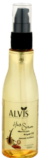
Hair Serum Moroccan Argan Oil 100 ml