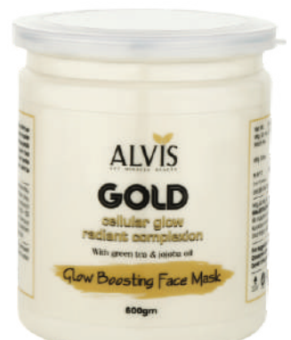
Glow Boosting Face Mask 600 gm