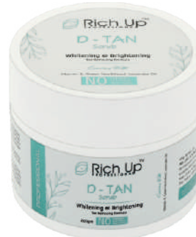
D-Tan Scrub 200 gm