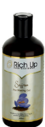
Saffron Pre Waxing Gel 300 ml

Liposoluble wax which gives a soft, smooth after leaving a lasting impression. It is creamy consistency make it easy to spread. Suitable for most body parts. The exceptional soothing and moisturizing properties of the liquid paraffin is ideal choice for dehydrate skin. The presence of titanium dioxide in the wax produce a creamy and gentle texture that help to reduce redness in even the most sensitive areas. The creamy texture is easy to spread and it and excellent grip and is less painful.