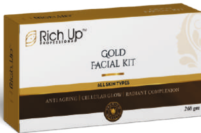
Gold Facial Kit - 260gm