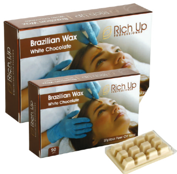
White Chocolate - 90 gm / 400 gm Stripless peel off wax