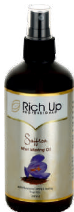
Saffron After Waxing Oil 300 ml