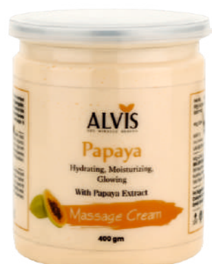
Massage Cream 400 gm