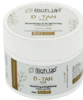
D-Tan Pack 200 gm