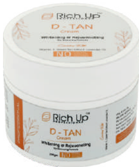
D-Tan Cream 200 gm