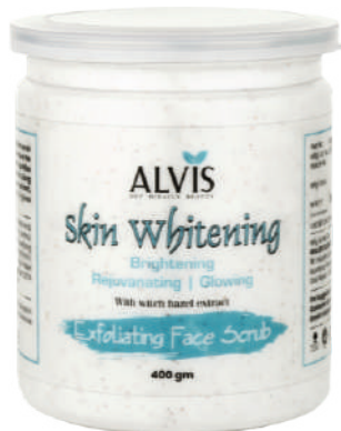
Exfoliating Face Scrub 400 gm